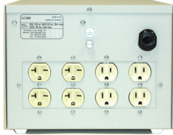
Rear view with optional receptacles